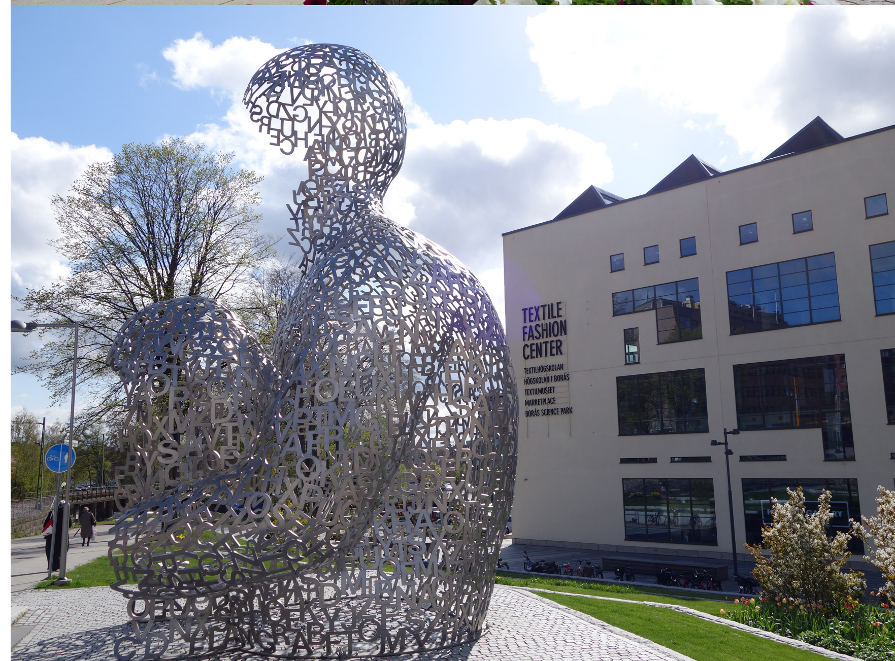
The University of Borås. A progressive institution and a pioneer in sustainability research, close to Gothenburg, Sweden.